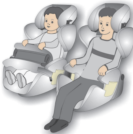
Figure 7: The Kiddy Guardian Pro 2 Car Seat with and without the protective impact cushion positioned