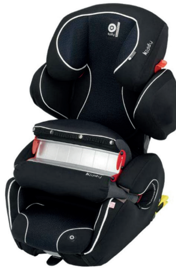
Figure 6: The Kiddy Guardian Pro 2 Car Seat