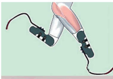
Figure 2: How the Cheetah blade works

The Cheetah blade compresses, storing energy.