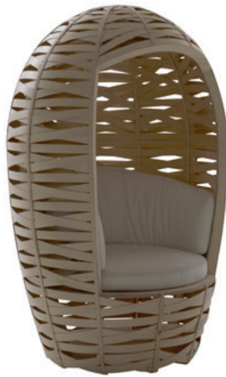
Figure 3: Secret Clubhouse chair